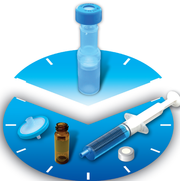
Fig 2. 3 times faster sample preparation combined with reduced solvent usage.