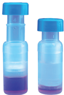
Fig 1. The Mini-UniPrep filter on the left is shown with fluid in the chamber. On the right, the filter plunger is shown compressed with the sample ready for analysis.

Place the sample in the Mini-UniPrep, insert the plunger, and compress. Your sample is filtered rapidly, easily, and in small volumes (Fig 1).